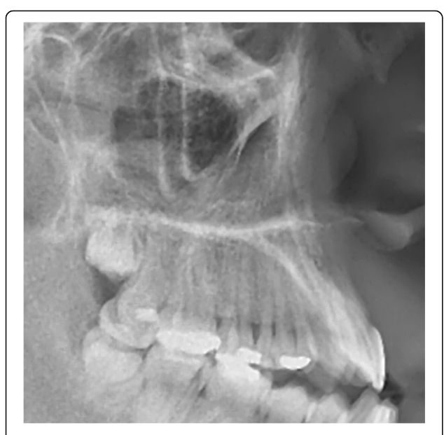
Fig. 2 Example of MPDD. The third molar was potentially blocked by the presence of the erupted second molar

Inter and intra-examiner reliability was assessed with the intra-class correlation coefficient (ICC). All cephalometric values were greater than 0.979 (CI 95 % 0.954–0.999). In addition, the Dahlberg error was less than 1° for all angular measurements and 1 mm for all lineal measurements. All the cephalometric tracings were made with at least a