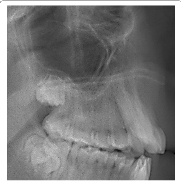
Fig. 1 Example of MPDD. The third molar was potentially blocked by the presence of the erupted second molar