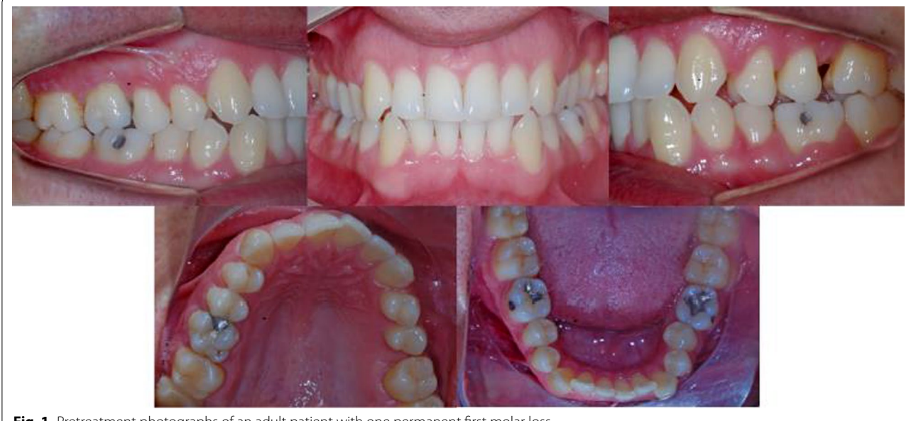
Fig. 1 Pretreatment photographs of an adult patient with one permanent first molar loss

Patients were orthodontically treated with pre-adjusted brackets, Roth prescription 0.022'' \times 0.028'' slot. The sample was divided into two groups. The first one consisted of patients who had loss of at least one permanent first molar (loss group, Fig. 1), and the second one consisted of individuals without tooth loss (control group). All patients in the loss group were treated with space closure without temporary anchorage devices (TADs). The inclusion criteria were patients in permanent dentition greater than or equal to 14 years, without loss of other dental elements—except for first permanent molar, impacted teeth, or agenesis. Surgical patients with