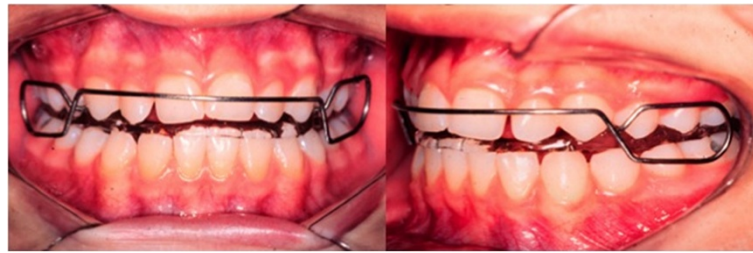
Figure 2 Bionator appliance.

headgear (KHG) for 14 h/day during fixed appliance treatment, as active retention. Others (40%) used class II elastics as active retention, for 14 h/day. These devices were used during 70% of the fixed appliance phase. After removal of the fixed orthodontic appliances, a Hawley plate was used in the maxillary arch and a canine-to-canine bonded retainer was used in the mandibular arch. All patients were treated non-extraction.