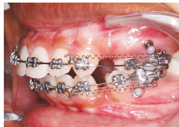
Figure 1 Assembly showing retraction mechanics using miniscrew as anchorage.

Each sample of PMCF was collected by a 1 to 5- \mu l calibrated volumetric micro-capillary pipette (Sigma Aldrich Chemicals Company Limited, Bangalore, India) placed at the crevice, according to the method described by Griffiths [12]. The samples were collected at the following time observations: T1 (4 h after miniscrew placement), T2 (baseline, 3 weeks just prior to loading) and on loading T3 (0 day), T4 (1 day), T5 (21 days), T6 (72 days), T7 (120 days), T8 (180 days) and T9 (300 days) (Table 1). Although PMCF sample T1 was taken 4 h after miniscrew placement to allow cessation of bleeding, PMCF samples