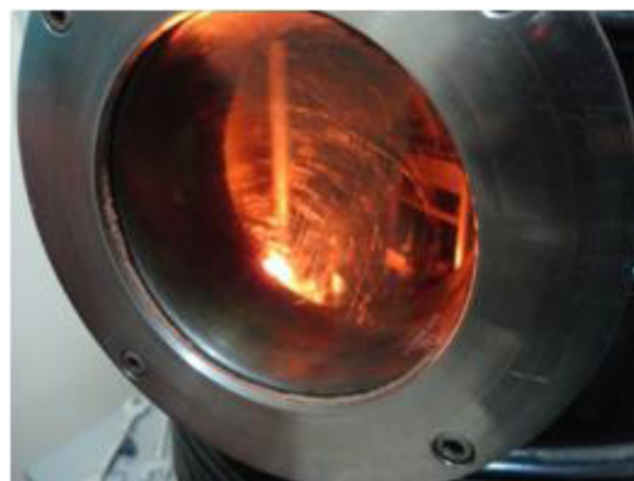
Fig. 2 Coating process

tubes, and the wires were immersed in it and were incubated for 24 h at 37 °C inside the laminar air flow chamber or inoculators (Fig. 3). Wires to which bacteria adhered were carefully removed and immersed in a 10 % formaldehyde solution for 30 min to immobilize the cells. After a careful rinse with distilled water, the wires were dried in a desiccator for 24 h. The weight change of the brackets during the bacterial adhesion test was recorded with an analytical balance.