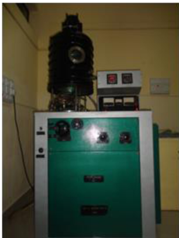
Fig. 1 Vacuum coating equipment

In a sterile beaker containing 10 mL of an MRS broth, an overnight-cultured lactobacillus culture broth was inoculated to a final concentration of 10 %. After this, 1 mL of this suspension was pipetted into each of the