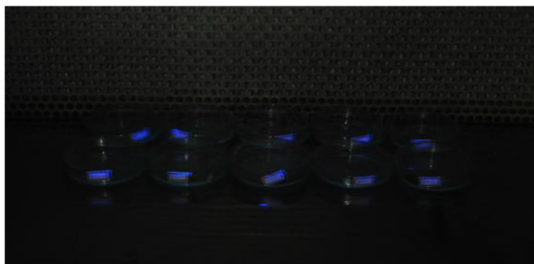
Fig. 3 Incubator