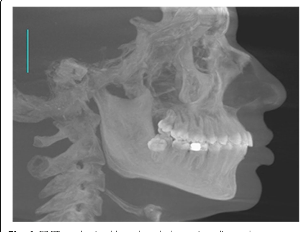
Fig. 1 CBCT-synthesized lateral cephalometric radiograph

Using iCATVision<sup>™</sup> software, two-dimensional slices, 0.3-mm thick, through each contact area were created. Orientation of each site in all three planes of space was carried out before measurement. The interradicular area of interest was located on the sagittal slice (Fig. 2a). The slice was then oriented so that the inter-radicular space was bisected by the vertical reference line and was parallel to the long axes of the roots. Orientation of the axial slice was then used to ensure that the horizontal reference line bisected the inter-radicular area and traversed the thinnest area of cortical bone (Fig. 2b). The horizontal reference line was moved to establish the measurement level in relation to the alveolar crest as seen on the coronal slice (Fig. 2c) [10].